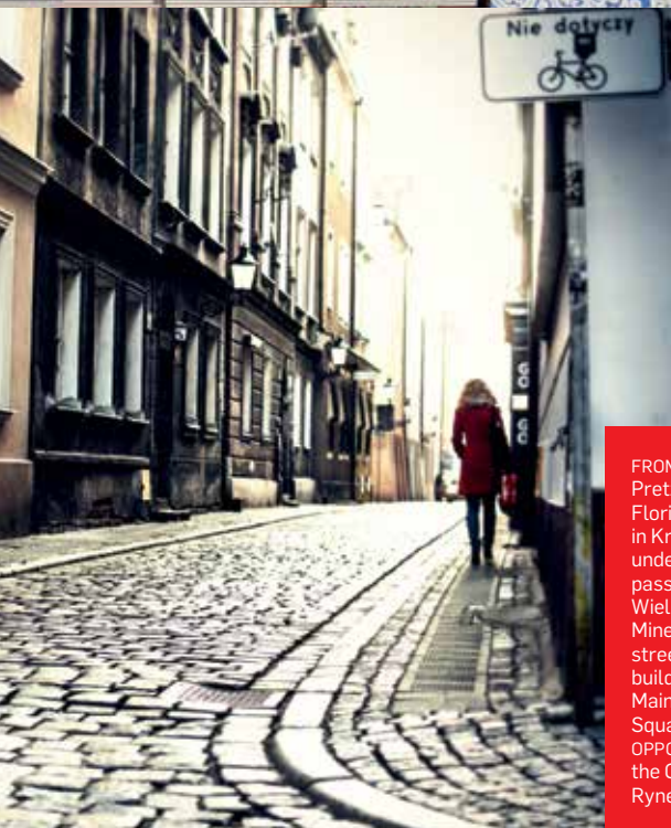
FROM ABOVE: Pretzel stall on Florianska Street in Krakow; underground passage in Wieliczka Salt Mine; a cobbled street amidst buildings; the Main Market Square, Zamosc. OPPOSITE: Cafe in the Cloth Hall in Rynek Główny.