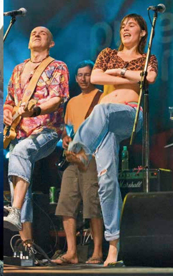
FROM LEFT: Art nouveau architecture in Subotica, Serbia; summer view of lake Kardjali, Bulgaria. OPPOSITE CLOCKWISE: A Dracula-themed restaurant in medieval Sighisoara, in Transylvania; rock band Gustafi performing at EXIT Festival; mountain walkers looking over a 200-metre shear drop in the Slovensky Raj National Park, Slovakia.